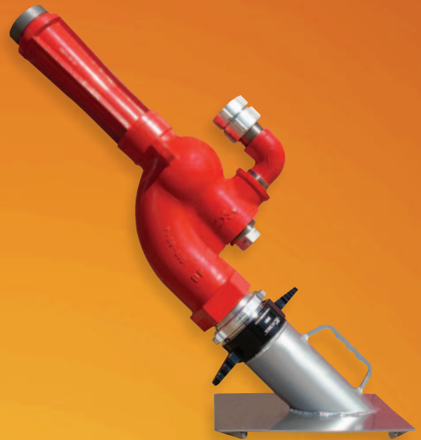
Model TD-250 TurboDraft Fire Eductor outfitted with basement strainer

Fire Departments are always in need of creative solutions to handle a multitude of emergency situations. Schutte & Koerting's 2 1/2" TurboDraft Fire Eductor (Model TD-250) is designed to assist rural and wildland firefighters in accessing static water sources outside the reach of traditional drafting techniques. Furthermore, the 2 1/2" TurboDraft Fire Eductor is a valuable piece of equipment for dewatering operations during flood emergencies.