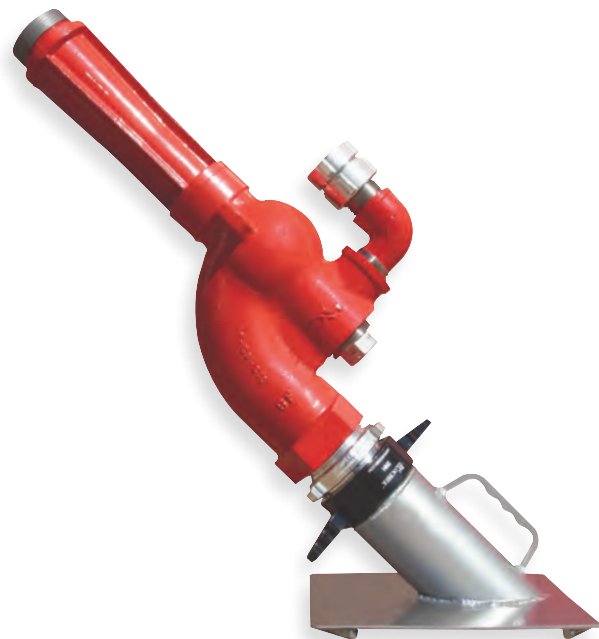
Model TD-250 TurboDraft Fire Eductor outfitted with basement strainer

Fire Departments are always in need of creative solutions to handle a multitude of emergency situations. Schutte & Koerting's 2 1/2" TurboDraft Fire Eductor (Model TD-250) is designed to assist rural and wildland firefighters in accessing static water sources outside the reach of traditional drafting techniques. Furthermore, the 2 1/2" TurboDraft Fire Eductor is a valuable piece of equipment for dewatering operations during flood emergencies.